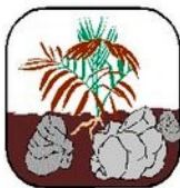
The Rocky Soil