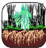
The Weedy Soil