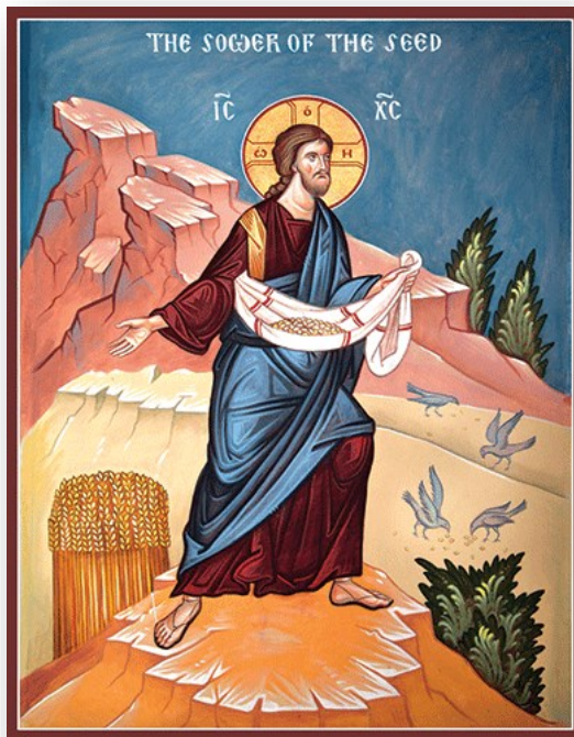
Притча про сіяча (Лука 8:5-15)