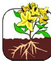
The Good Soil