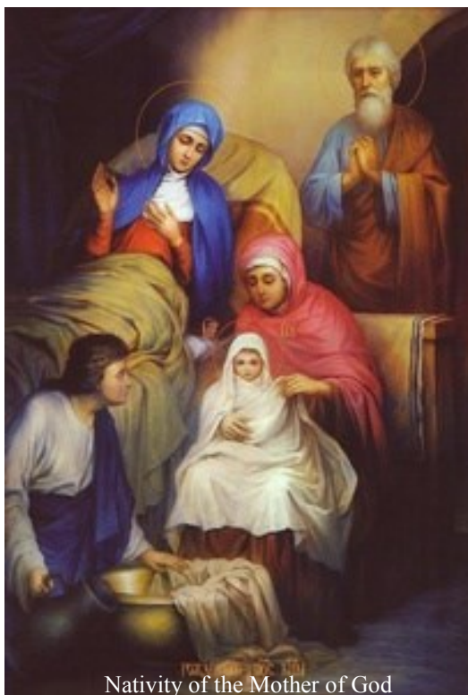
Nativity of the Mother of God