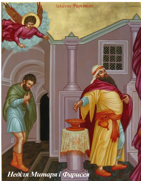
Неділя Митаря і Фарисея

CATECHETICAL PROGRAMS: See inside for specifics